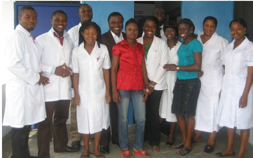
The Entire Staff:

My fellow colleagues were amazing; Also had the opportunity to learn from them. A truly rewarding experience.